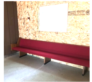
The pews are set up for pray circles in the new cabins.