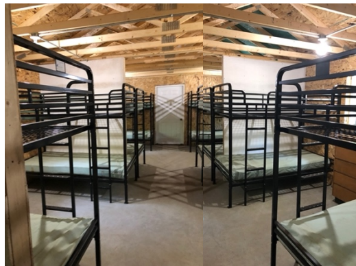
Sixteen metal bunk beds were assembled to make the two cabins ready for campers.