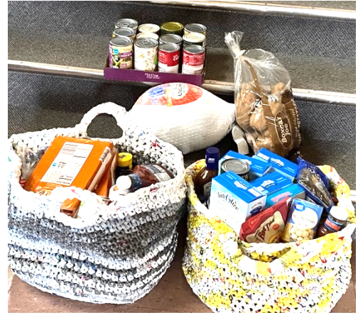
Thanks to all who donated!