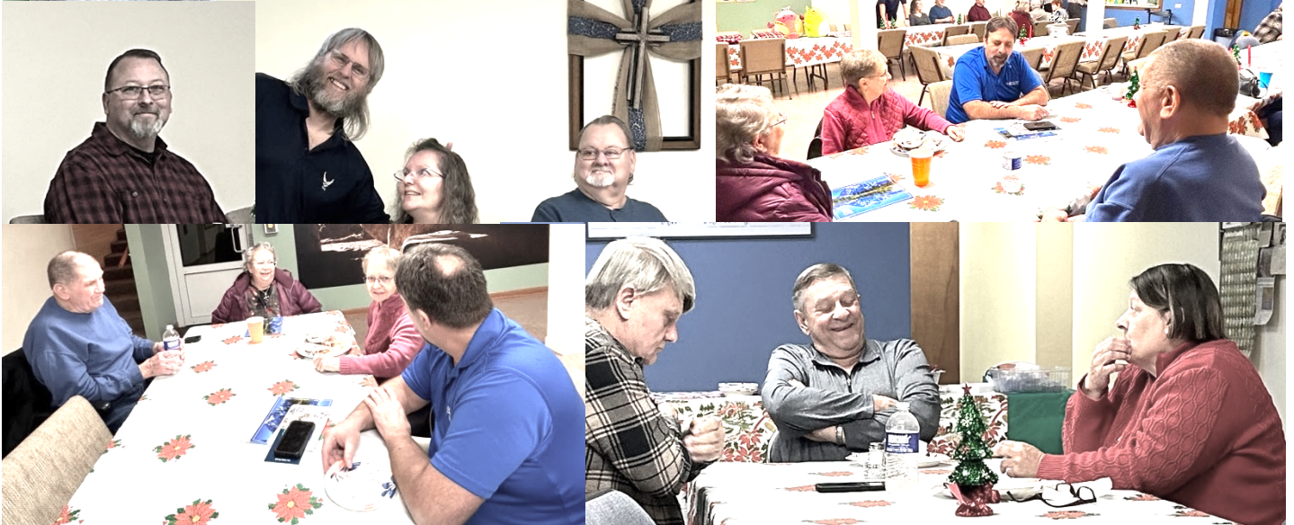
Family fellowship enjoying Christmas dinner!