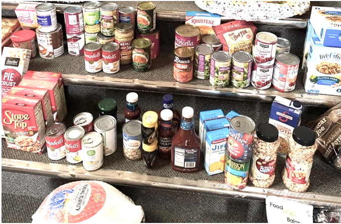
Food donations for Thanksgiving and Christmas!